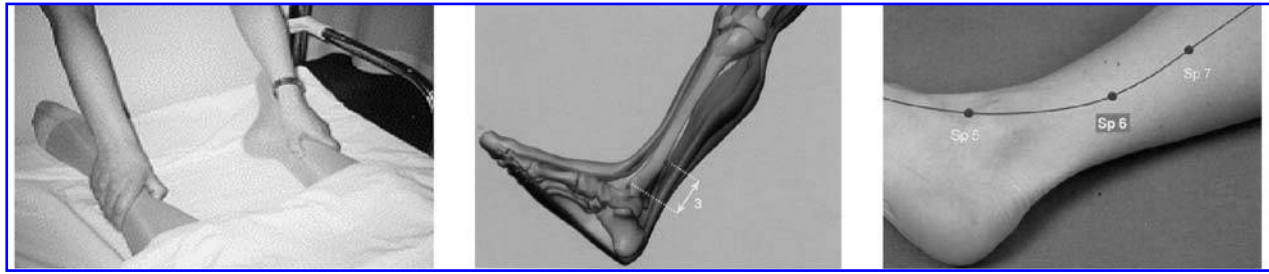
FIG. 1. SP6 acupoint.